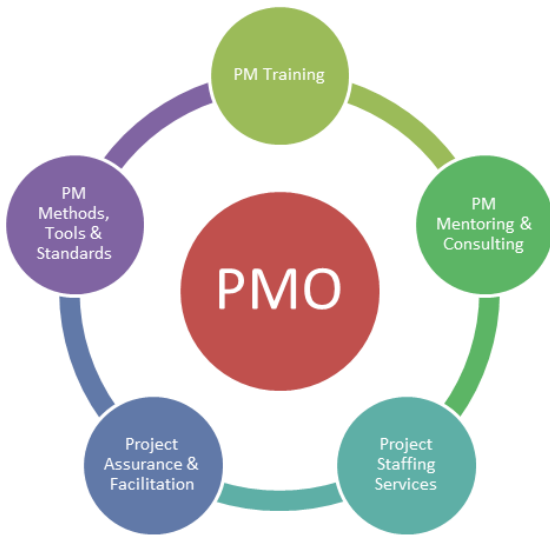
Figure 1: Project Management Services Model

managers hold or are in the process of achieving either PMP® or PRINCE2® certifications. We proactively provide independent project assurances and support on all engagements, ensuring that project plans are realistic and are performing as reported, that quality expectations are being met and that standards are being followed.